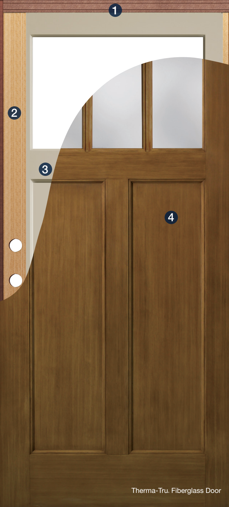
Therma-Tru. Fiberglass Door